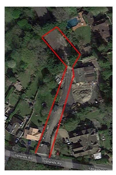
Figure 2 Existing site plan and aerial photo