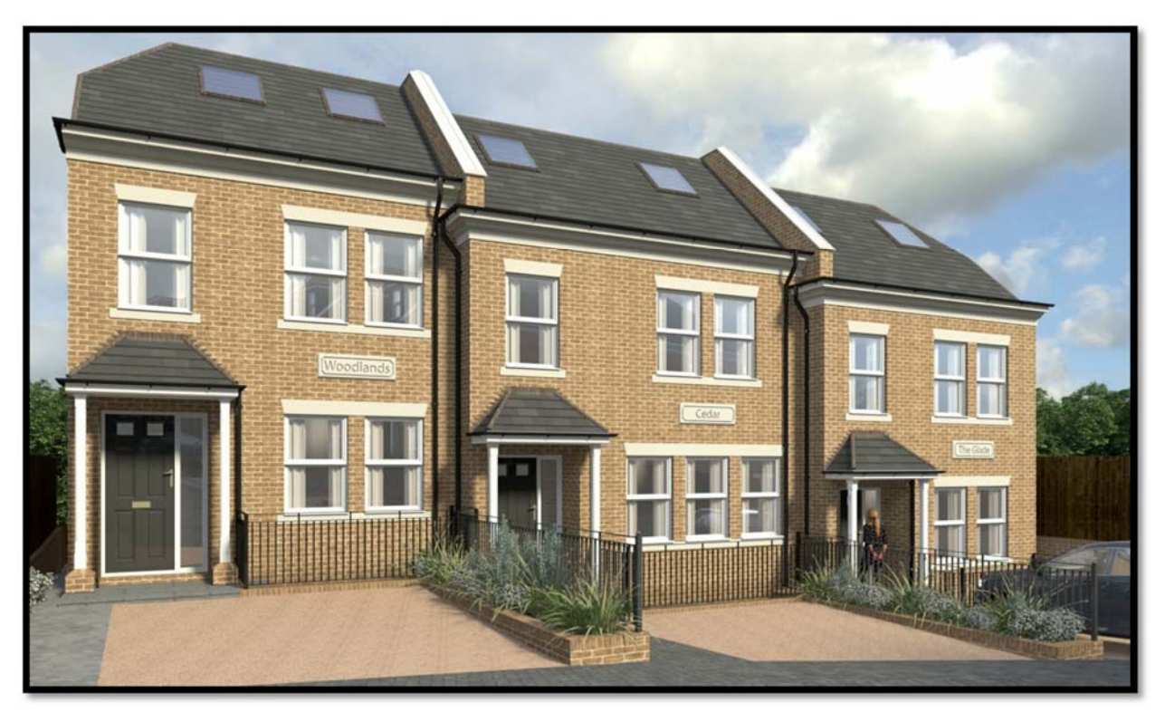
Submitted CGI detailing of the front elevation.