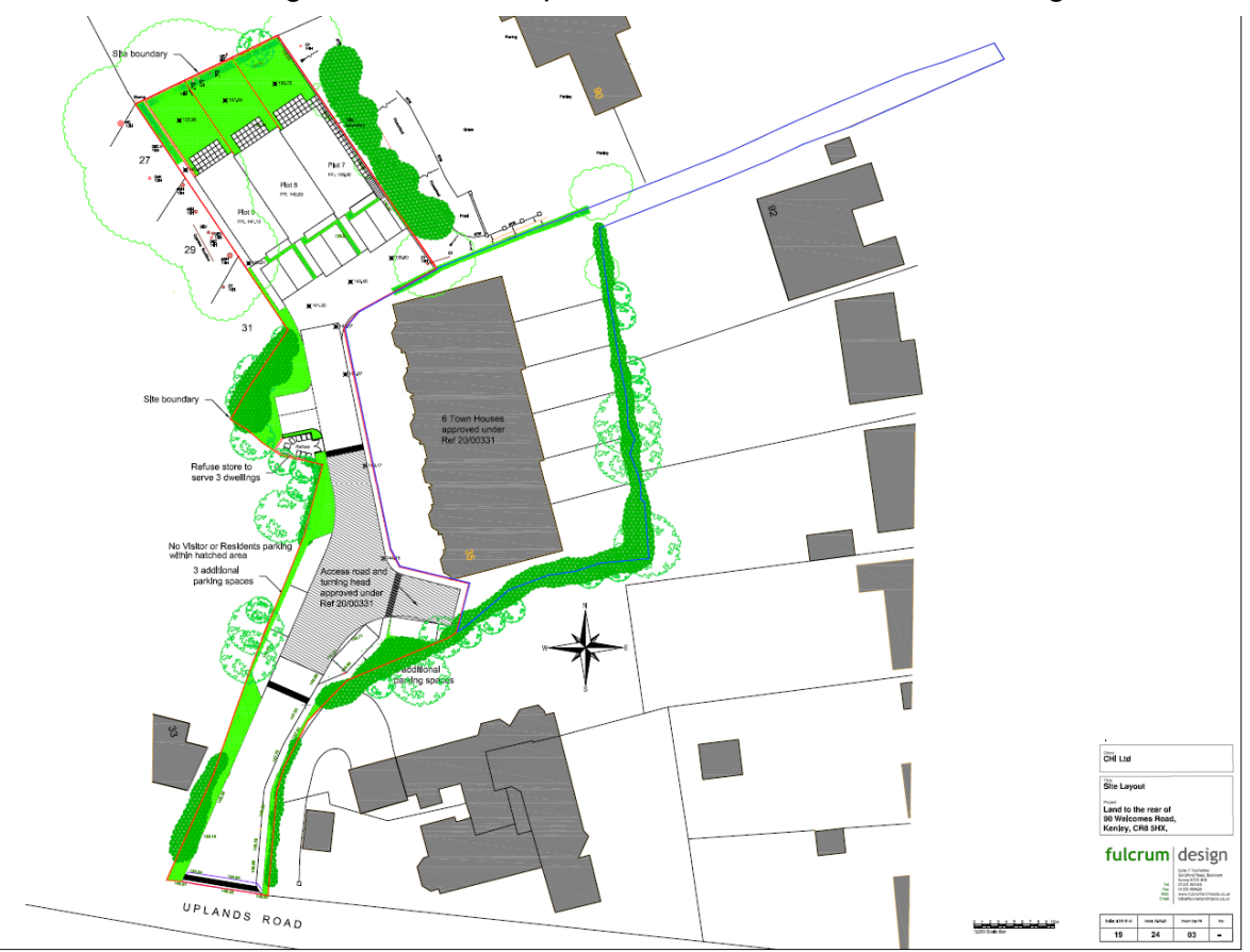
Figure 1 Proposed site plan (showing approved scheme to south)