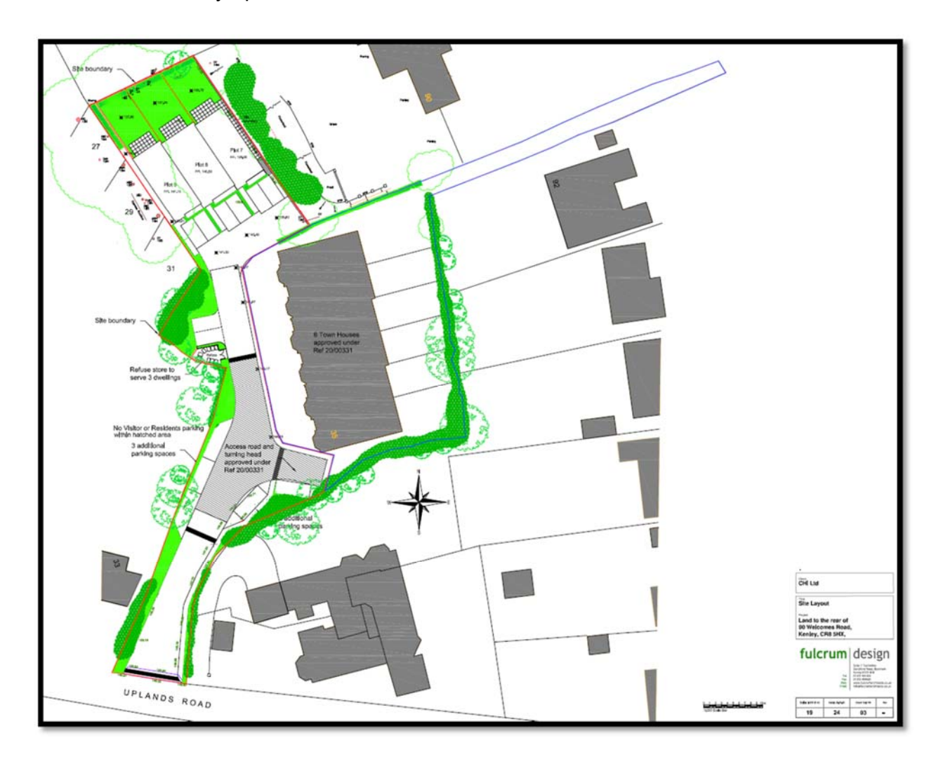
Figure 3 Proposed site layout

8.8 The site as aforementioned forms part of a site previously granted consent for residential development. The proposed development site is itself an anomaly within the wider area. The wider site is a backland location, situated behind houses that front Uplands Road and Welcomes Road, approximately 80m from the road. The land levels fall from the road level to the northern end of the site. The site has limited visibility from the public realm, with the exception of the vehicular access. It is noted that works have commenced on site for the development of the previous onsite approval for the 6 town