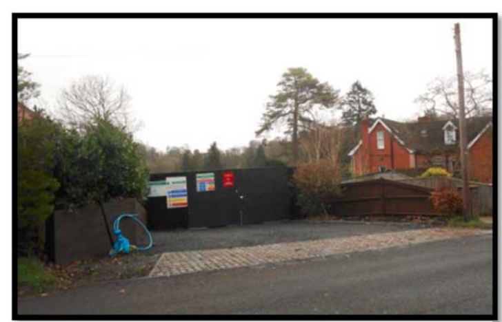
Figure 4 Photos of site access from Uplands Road.